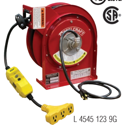
L 4545 123 9G