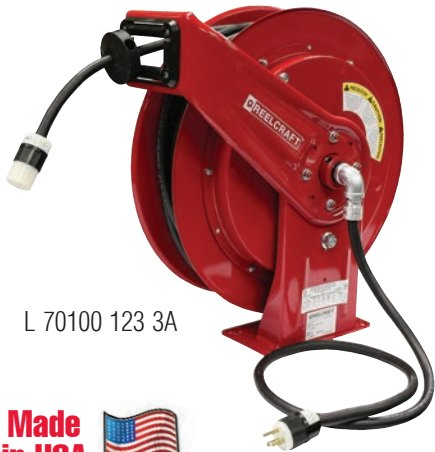
L 70100 123 3A