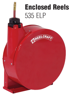
Enclosed Reels 535 ELP