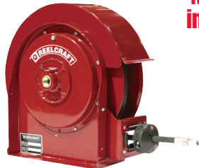
Air Vend Reels AV4425 OLPBWR